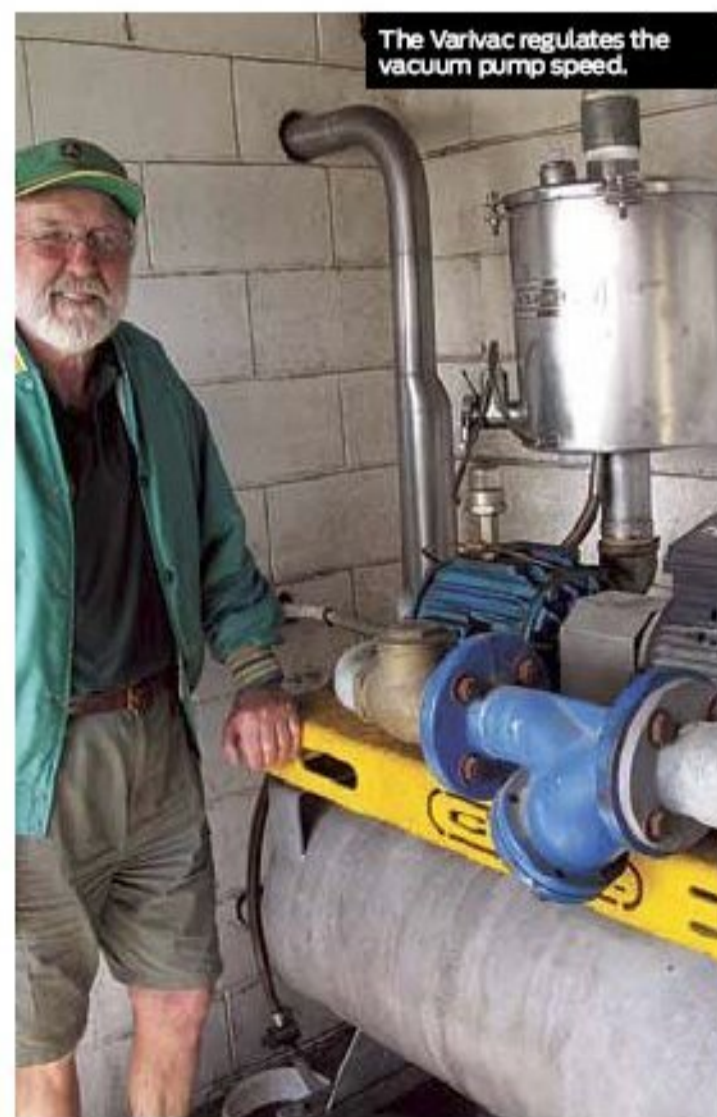
The Varivac regulates the vacuum pump speed.

can happen to the milk." Tel. 0800 10 7008